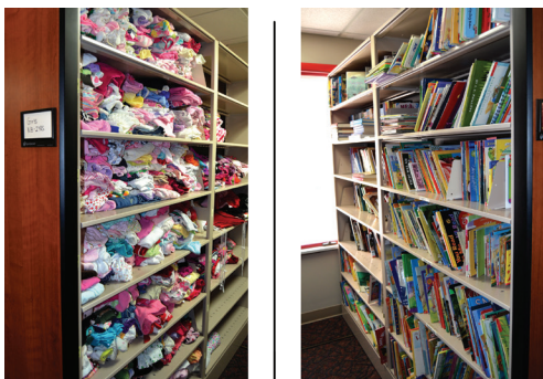
Books and clothing are made available in the office for patients.